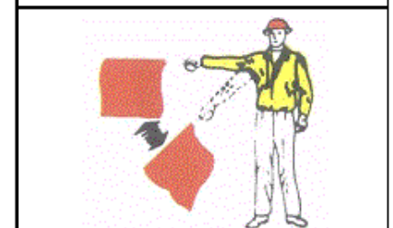
TRAFFIC SHOULD BE CAUTIOUS