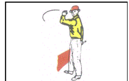
TRAFFIC MUST PROCEED