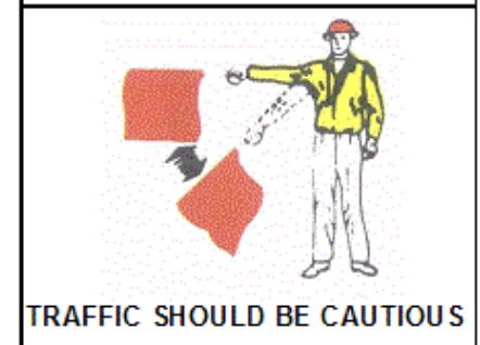
TRAFFIC SHOULD BE CAUTIOUS