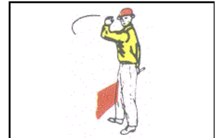
TRAFFIC MUST PROCEED