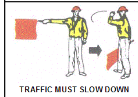
TRAFFIC MUST SLOW DOWN